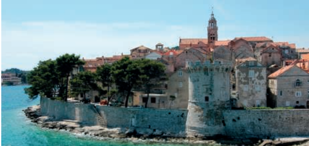
Savor the unique Venetian influence of the Dalmatian islands during your stay in Korcula

Join those in the know who are heading for the sun drenched islands of Dalmatia. Enjoy a narrative ranging from Roman times through to the Bosnian war.