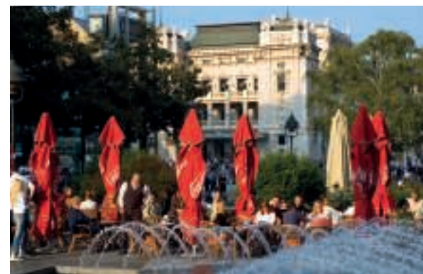
Relax and enjoy Belgrade

DAY 16 – RETURN TO CANADA. It's time to take home some wonderful memories and a camera full of stunning photography. Departure transfers arrive at Belgrade Airport at 10:30 (BB)